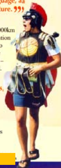
A Roman Soldier

Rome: a heritage shared by North and South Americans, Europeans and citizens of many third world nations helps bring students into the mainstream of western culture.