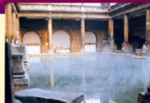
The Roman Baths of Bath