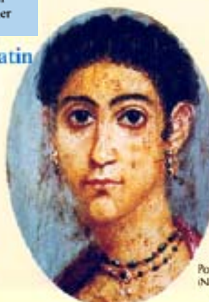
Portrait of a Roman lady (from Hawara, Egypt (No. 74706 Dept. of Egyptian Antiquities, British Museum)

Related subjects come alive because the Romans influenced scientific terms, city planning, mythology, history, athletics, film, theater, historical fiction, fine art and classical music.